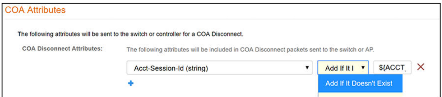
FIGURE 4 CoA Attribute to Send to SmartZone 5.1

The following illustration depicts the attribute settings described above, but note that the box on the right does not display all the characters of the entry #{ACCT_SESSION_ID} simultaneously.